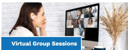
Virtual Group Sessions

There's never been a more important time to quit.