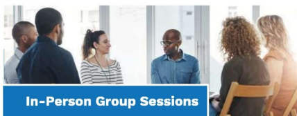
In-Person Group Sessions