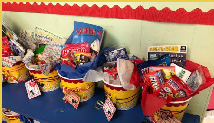
Pictured: Family Baskets at Library Partnership Resource Center.