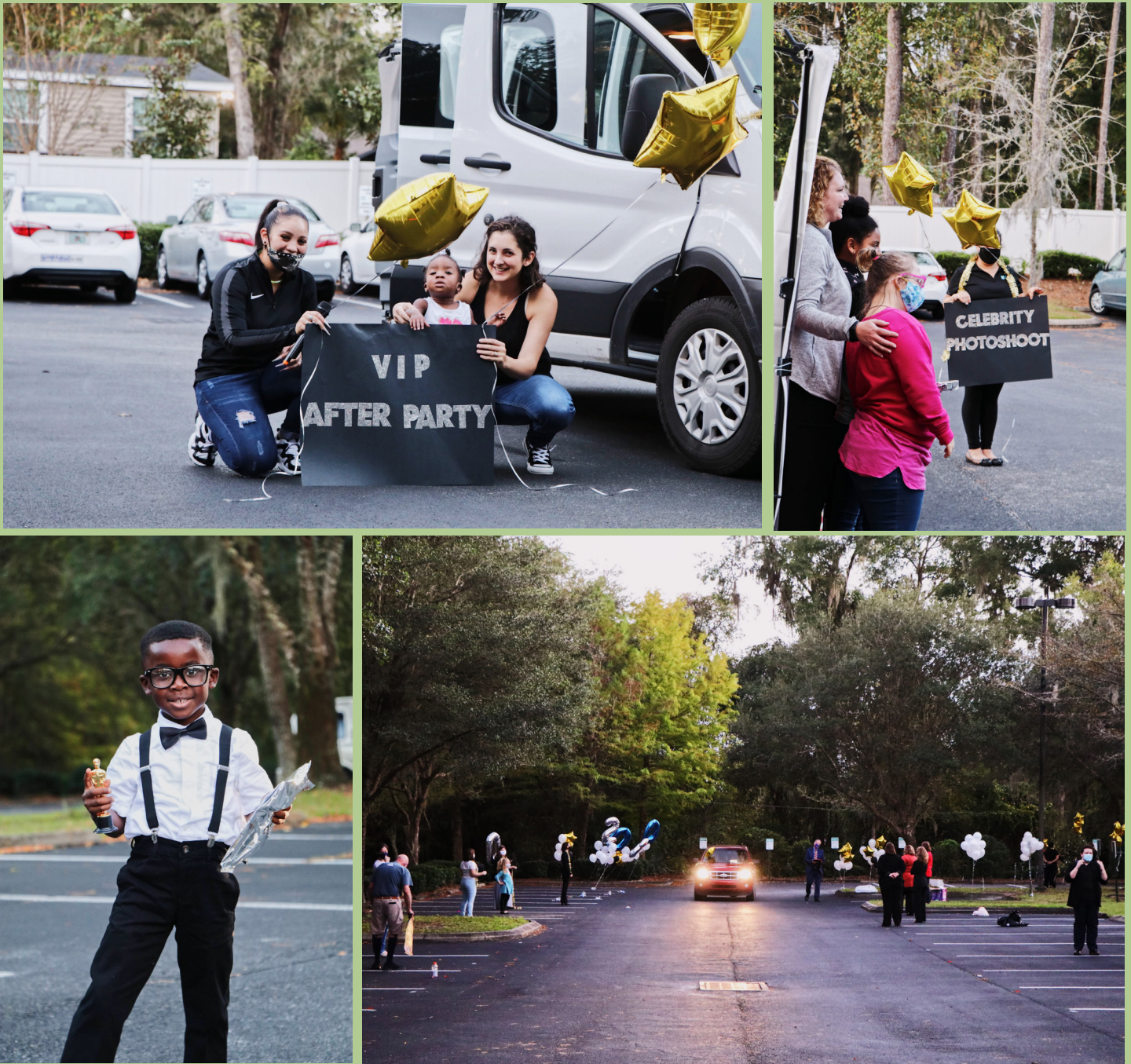
Pictured above: Photos from our National Adoption Day Drive-Thru Celebration!

This past November we had the opportunity to celebrate National Adoption Month – 2020 style! Our incredible PSF adoptions team held a drive through celebration for many of our families that had an adoption during the year. Every family got to drive through their very own red-carpet event with many different child welfare employees and partners there to cheer them on with dances and gift bags as they rolled through. This past year put a pause on many things, but the celebration of new families is something we will always celebrate even if it looks a little different.