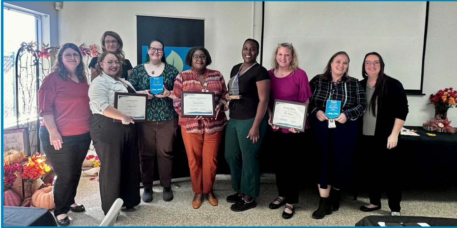
PSF Staff Recognition Awards