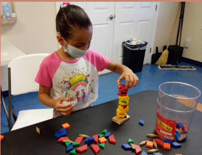
SWAG Family Resource Center's summer program.