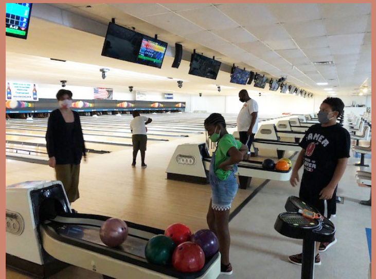
Bowling field trip for Library Partnership Resource Center's summer program.

AS ALWAYS, THANKS TO OUR MANY PARTNERS WHO MAKE IT POSSIBLE TO CONTINUE SAFELY PROVIDING SERVICES AND SUPPORTS FOR THE LOCAL COMMUNITY!