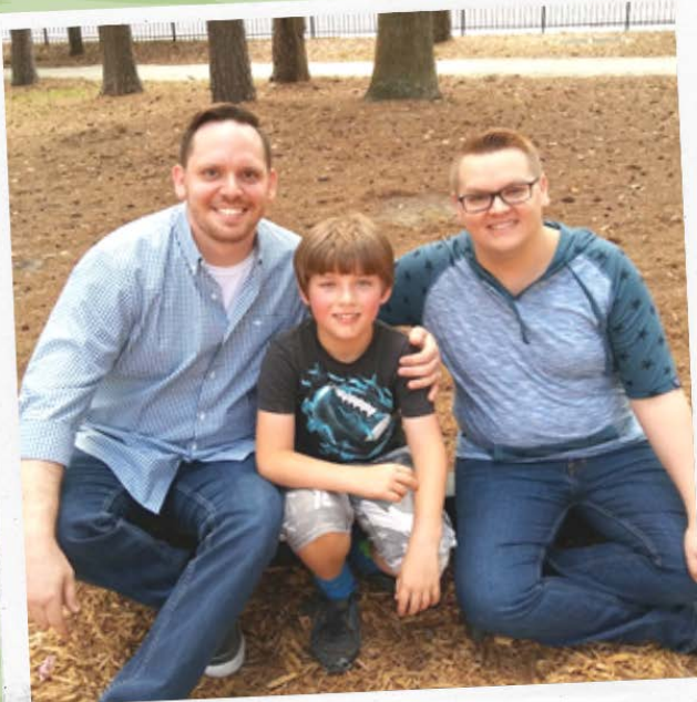
The Bergman Family