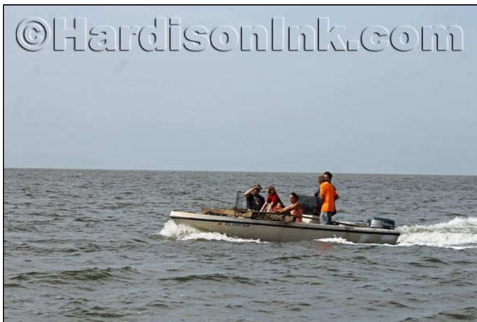
A group of commercial oyster harvesters cruises through the Gulf of Mexico off of Levy County.

During the hours of touring, some things became obvious.