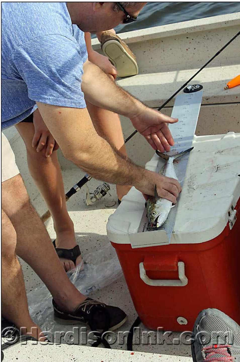
The mackerel is measured. This picture was taken before the fish's lips were slid up to the point where measurement began. It was longer than 12 inches long. A flounder caught within minutes of this fish also measured to be proved as a keeper.