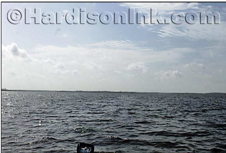
Some of the many beautiful natural scenes that can be observed from a boat in the Gulf of Mexico off of the coast of Levy County show why this part of the Gulf is a destination for boaters and fishermen. The natural beauty here remains untarnished by buildings on the shoreline.