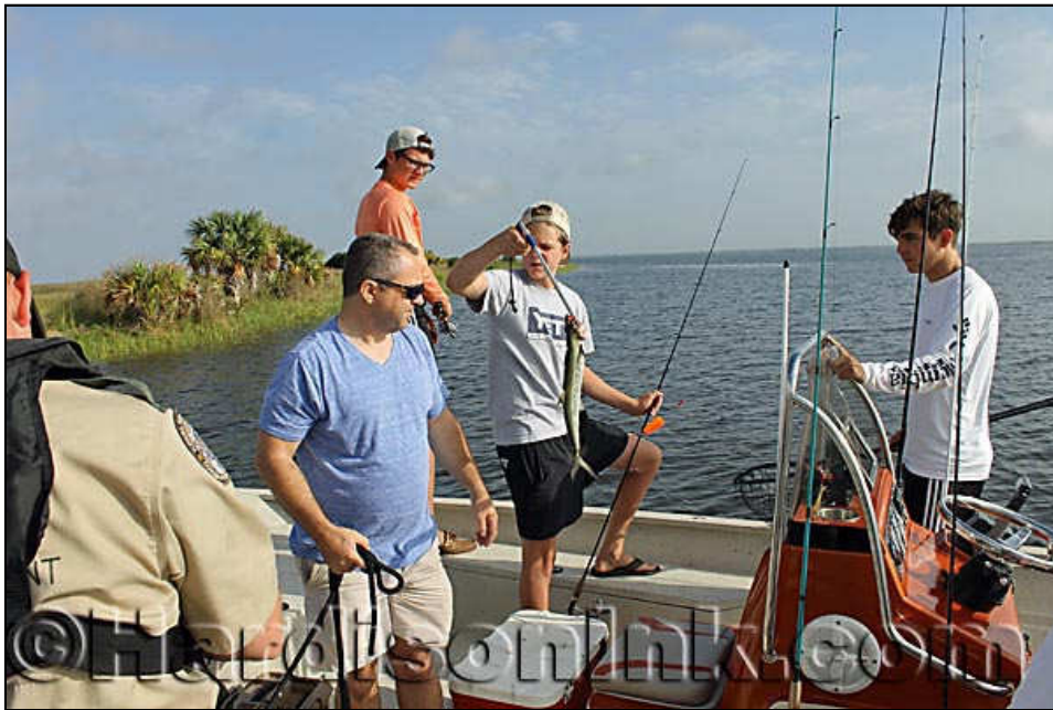
A young fisherman holds a mackerel he caught as the FWC officers were checking safety equipment.