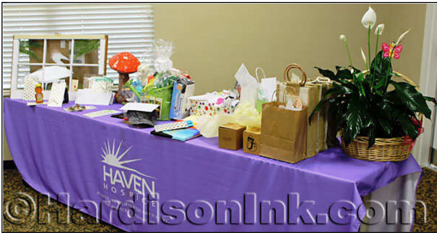
A table full of door prizes reflects donations by business interests to show appreciation to Haven Hospice volunteers. These prizes came from the whole Tri-County Area of Levy, Dixie and Gilchrist counties.

Volunteers for Haven Hospice received a meal, gifts, door prizes and thanks from the administration and staff of the institution during the yearly special and fun event.