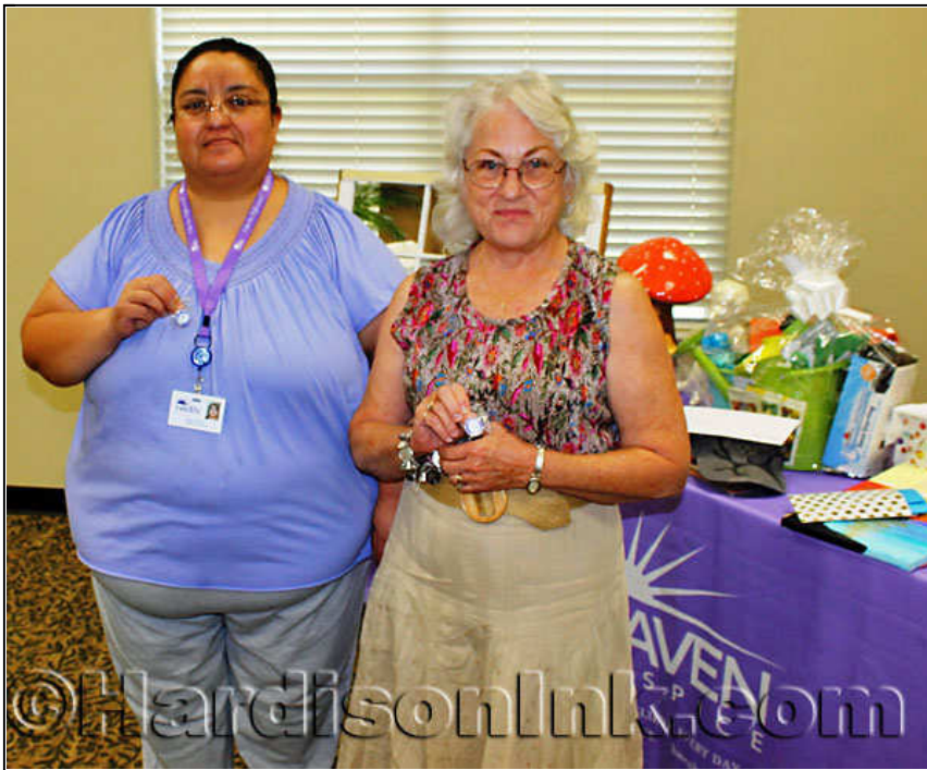
Two of the 3-Year pin award recipients are seen above.