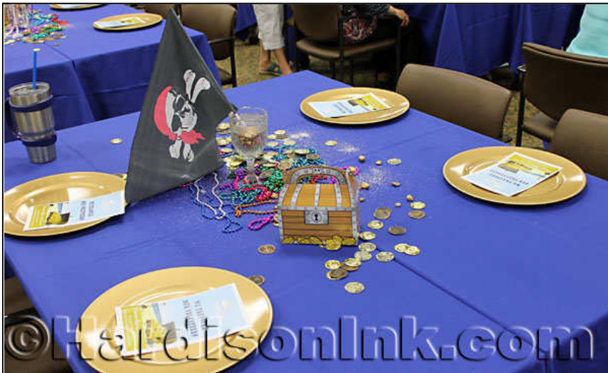
The theme for the luncheon this year was 'We Treasure Our Volunteers.' There were trinkets on every table, including treasure chests and mock gold coins. On this table, there was also a pirate's flag.

CHIEFLAND -- Haven Hospice held its annual luncheon to honor volunteers on Friday afternoon (April 14).