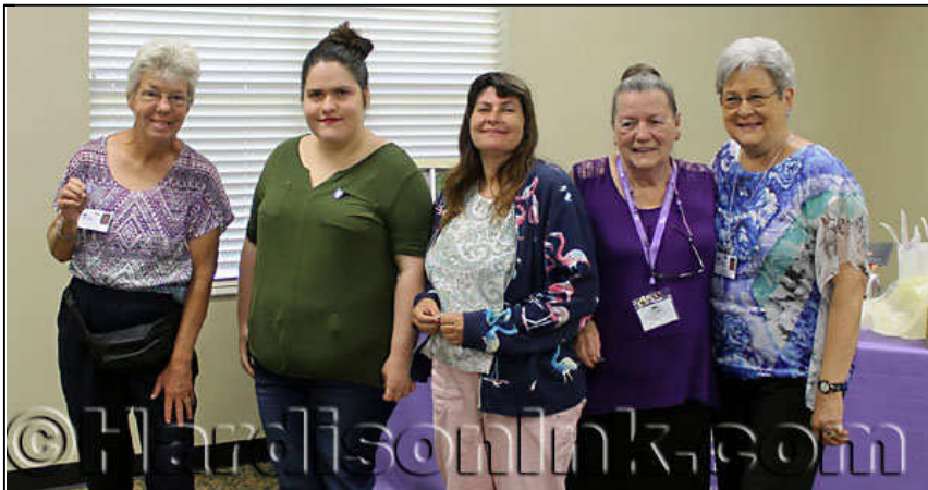
Above are some of the 1-Year pin award winners.