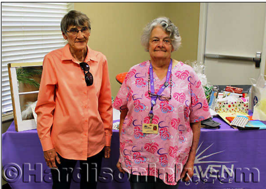
Two of the 5-Year pin recipients are seen above.