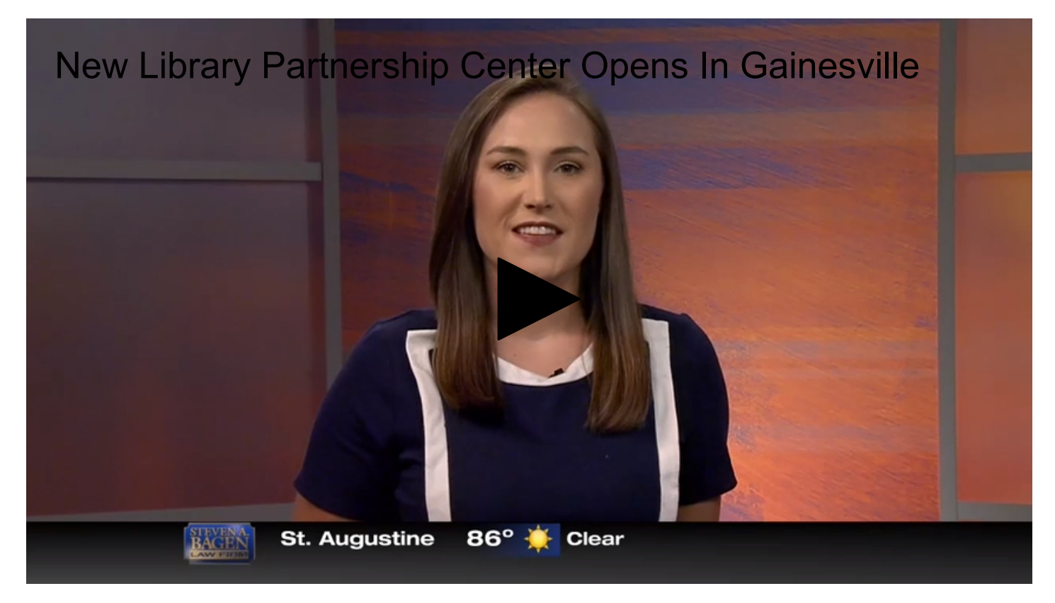
Posted: Sat 6:40 PM, Aug 11, 2018

A brand new hybrid library and social services center opened its doors to the public Saturday. Take a look at some of the opportunities this new space offers for the community.