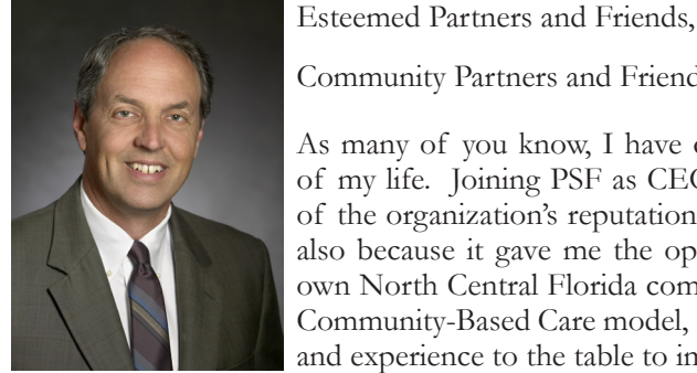
Community Partners and Friends,

As many of you know, I have called Gainesville home for the majority of my life. Joining PSF as CEO was appealing to me not only because of the organization's reputation as a top-notch child welfare agency, but also because it gave me the opportunity to return home to impact my own North Central Florida community. This is really the essence of the Community-Based Care model, that we each bring our unique knowledge and experience to the table to impact our own communities.